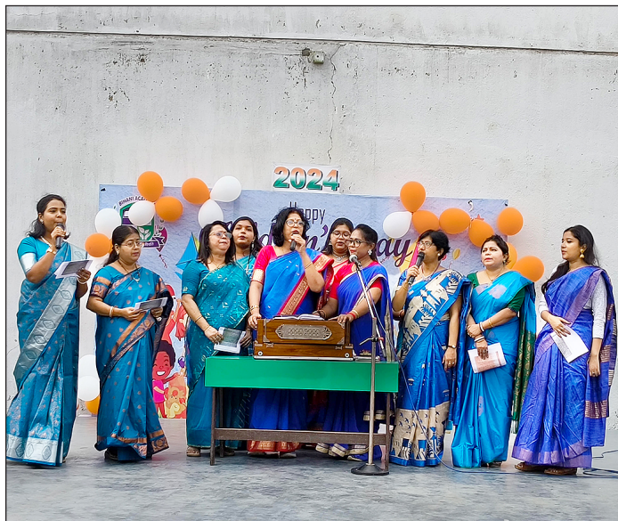
A choir of teachers present a medley of eastern and western songs