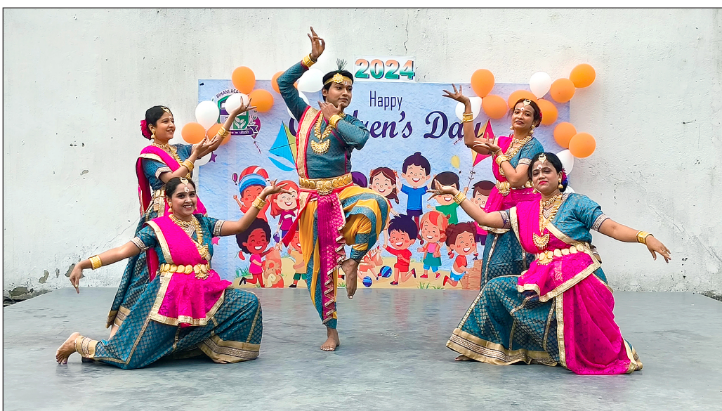
Senior teachers present a classical dance performance, Adharam madhuram

Suspense gripped the grounds of Bihani Academy. Students kept whispering among themselves while teachers dodged all questions carefully, keeping everything under wraps.