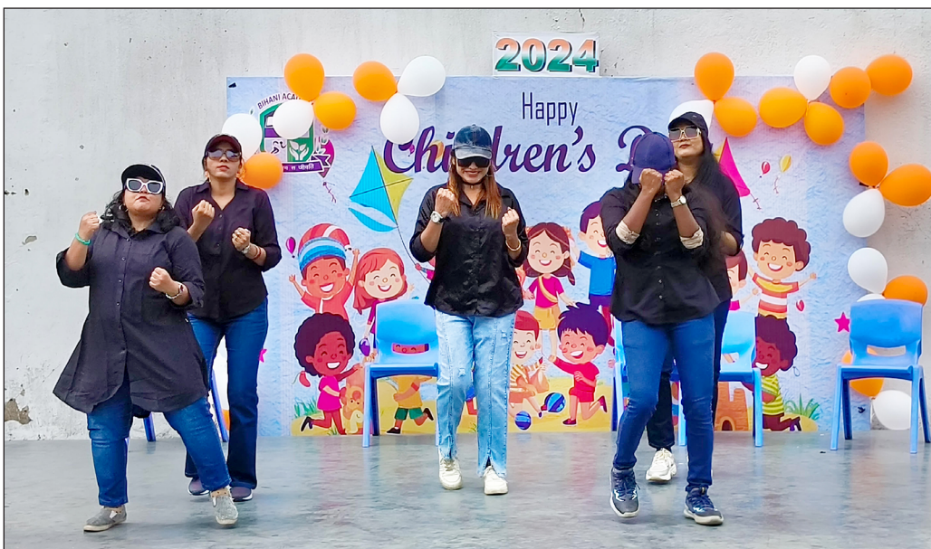
Teachers groove to the beats of popular Bollywood songs to entertain the children