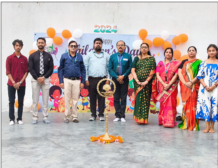
Teachers and principal light the inaugural lamp to kickstart the Children's Day programme