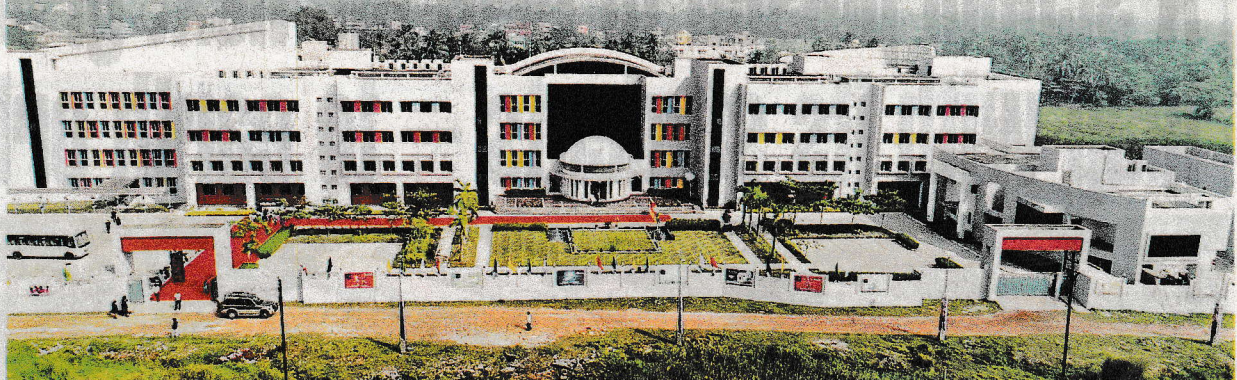
The school campus