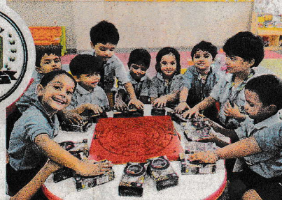
An extra-curricular class in progress; (below) students attend a class